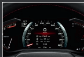
7" MULTI-INFORMATION-DISPLAY WITH RED ACCENTS