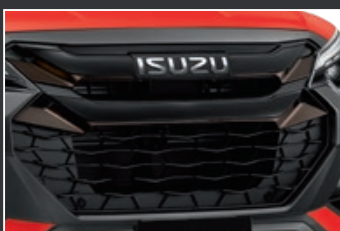
DARK GREY FRONT GRILLE