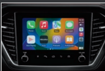
9" TOUCHSCREEN WITH APPLE CARPLAY® & ANDROID AUTO™

The D-MAX X-TERRAIN combines signature toughness with sleek urban charisma. Whether you're on a worksite, navigating the city or ruling off-road, it's bigger, bolder and even more decisive. The X-TERRAIN features stylish dark grey highlights and exclusive features such as an Aero Sports Bar, Fender Flares, Roof Rails, 18" Alloy Wheels and a lockable Roller Tonneau Cover. On the inside, the X-TERRAIN comes with a large 9" central infotainment touchscreen with wireless Apple CarPlay® and wireless Android Auto™ as well as a 7" Multi-Information-Display that allows the driver to access a variety of information behind the steering wheel. Plus, with the legendary Isuzu 3-litre turbo-diesel engine, 3.5t towing* capacity, 5-Star ANCAP safety, 4x4 Terrain Command and Rough Terrain Mode, the X-TERRAIN offers the total package. To top it all off, the D-MAX X-TERRAIN gains an exclusive new colour - Sunstone Orange mica - an eye-catching paint finish.