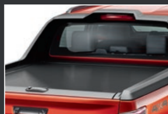
DARK GREY AERO SPORTS BAR & ROLLER TONNEAU COVER