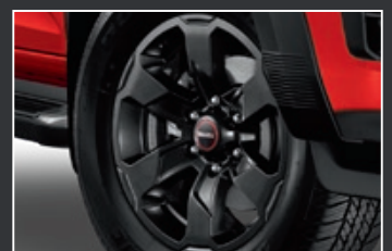
18" MATTE DARK GREY ALLOY WHEELS

Apple CarPlay is a trademark of Apple Inc. Android Auto is a trademark of Google LLC. Not all devices will be compatible & functionality will vary depending on the device.